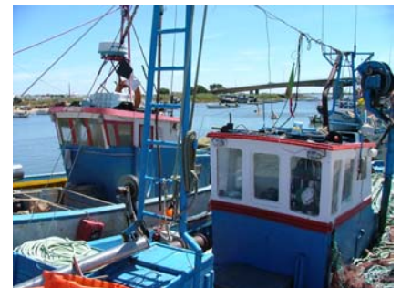
Taviran Fishing Boats