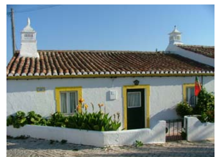
An Algarvian Fisherman's Cottage