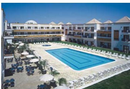
The Outdoor Pool