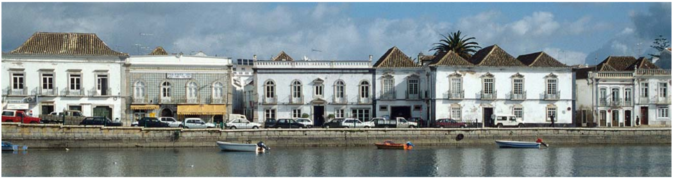
Traditional & Historic Architecture Lines The Banks Of The River Gilão