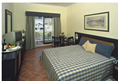
A Standard Pool View Room