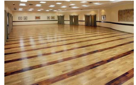
The Vila Galé Tavira Ballroom